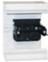
FLine® assembly holder MH