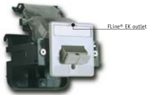
FLine® EK outlet