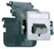
FLine® EK outlet