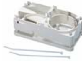
FLine® cable reservoir KR