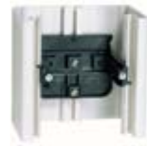
FLine® assembly holder MH