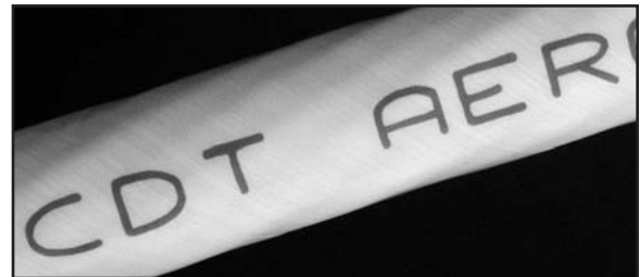
Clear, crisp laser marking enhanced by smooth outer surface.